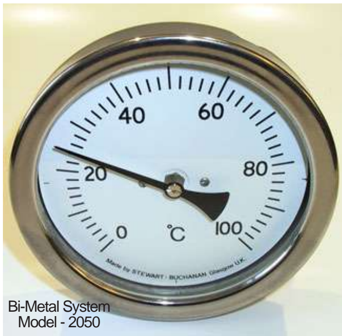
Bi-Metal System Model - 2050

State:- Temperature gauge model / Nominal size / Scale range / Stem dia - length / Size of connection / Optional extras reqd.